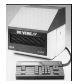
Closed Loop Dichromat