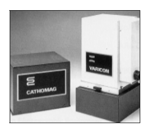
Cathomag and Varicon